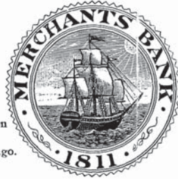
Engraved on wood over 50 years ago.