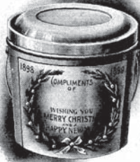
Vignetted half-tone from wash drawing.