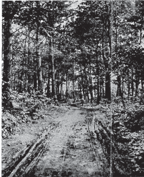
Pretty effect in green. A view along the North Beverly shore.