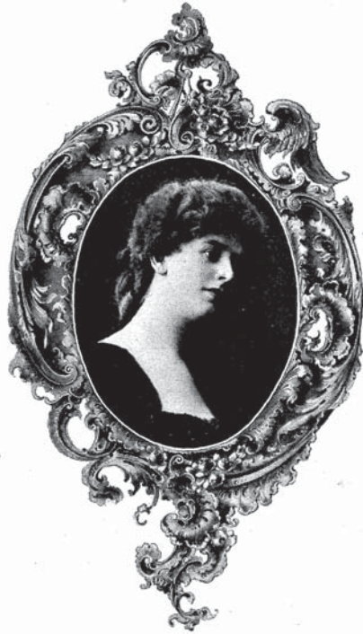
Ornamented portraits for souvenir booklets, college annuals, etc.