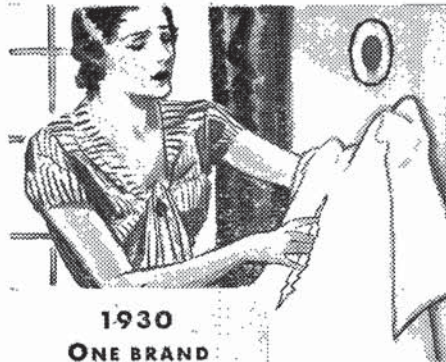
1930 ONE BRAND WORE OUT