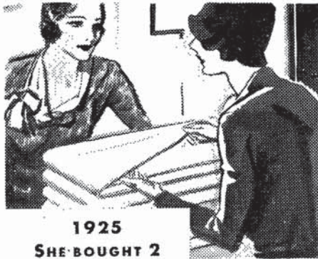
1925 SHE BOUGHT 2 KINDS OF SHEETS